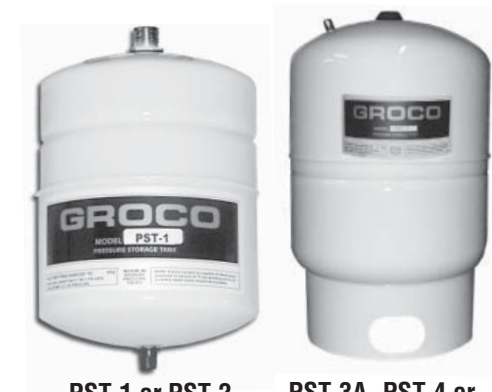
PST-1 or PST-2 PST-3A, PST-4 or PST-5

Check the PST air charge (with no water pressure present) at least monthly.